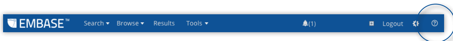
Figure 6. Click the question mark icon to open Embase Help.

Embase Help also has information about our Embase webinar series and instructional videos. These will give you more detailed tips on searching, using PICO search strategies and more.